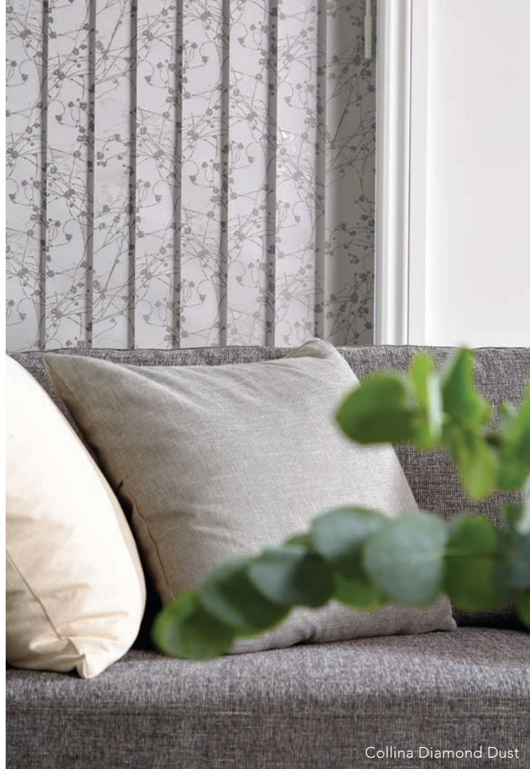
Collina Diamond Dust