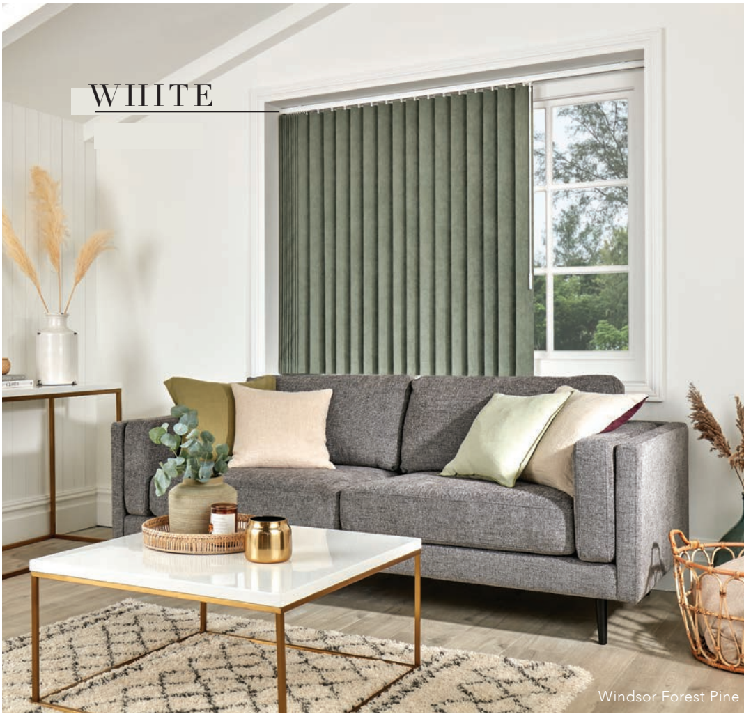
Windsor Forest Pine