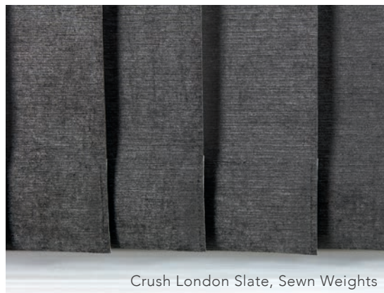
Crush London Slate, Sewn Weights