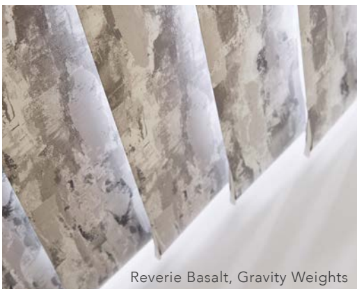
Reverie Basalt, Gravity Weights

For a contemporary aesthetic there's the option of 'sewn in' weights and 'gravity weights', removing the need for chain and finishing off your blind perfectly.